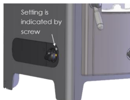
Figure 1: Setting the thermostat

If a lower radiator temperature is required a lower number should be selected. Some experimentation may be necessary to find the setting best suited to your preferences/ environment.