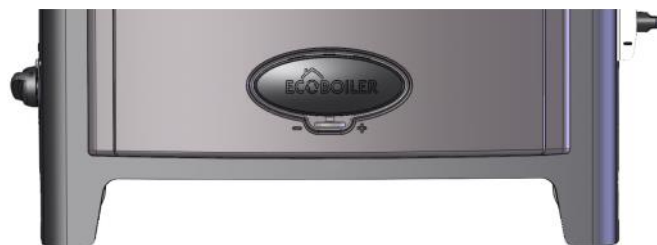
Figure 3 Easy Boost air control

Always close the Easy Boost slider if the stove is to be left unattended. This is to allow the stove's automatic thermostatic control to function correctly - a crucial requirement to help prevent the water from boiling