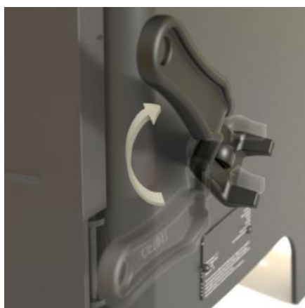
Figure 4 Use the operating tool on the riddle control

Whilst burning solid fuel it can be beneficial to occasionally riddle the grate bars so any burnt fuel will fall between the grate bars into the ash pan below. This will ensure a good under draught is maintained. Whilst using supplied safety glove,, this should be done by rocking the supplied operating tool on the external riddle control as per figure 4..